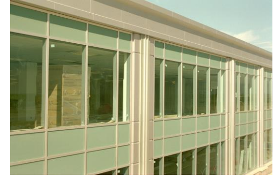
Horizontal profiles at roof edges provide a shaded look.

Function and form in one panel. Formed shapes and seamless reveals.